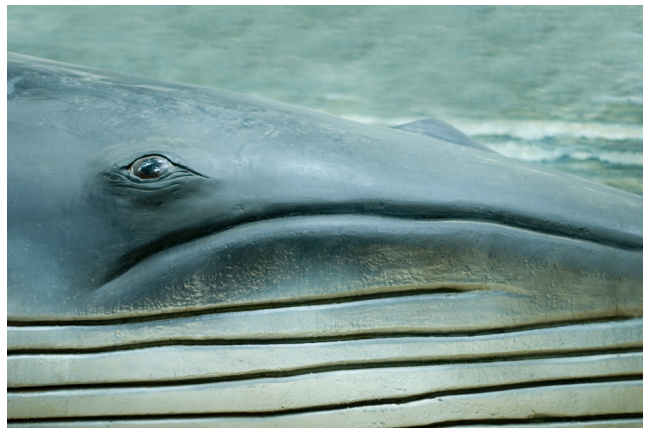
Grooves that allow the blue whale's mouth to expand to hold more water

Blue whales eat tiny sea animals. First the blue whale takes a big gulp of water. As it takes in water, it stretches the sides of its mouth, filling up like a balloon. The blue whale pushes the water through a filter in its mouth called a baleen. The water flows out of its mouth. Small